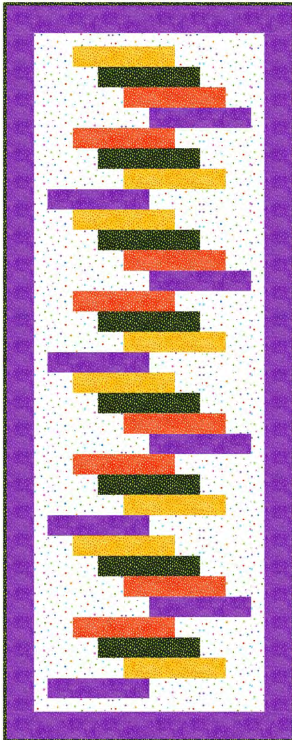
21-1/2" X 54-1/2"

Design by Brenda Plaster, Spool and Bobbin Quilting Pattern available at www.spoolandbobbinquilting.com