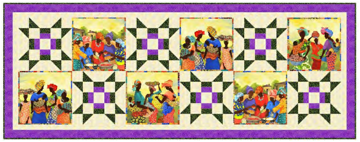
65-/2" x 25-1/2"

Design by Brenda Plaster, Spool and Bobbin Quilting Pattern available at www.spoolandbobbinquilting.com