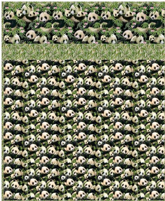
Quilt side 41" X 50" Folded: 16" square

Quilt Design by Deborah G. Stanley 2018: Elizabeth's Studio LLC—All rights reserved